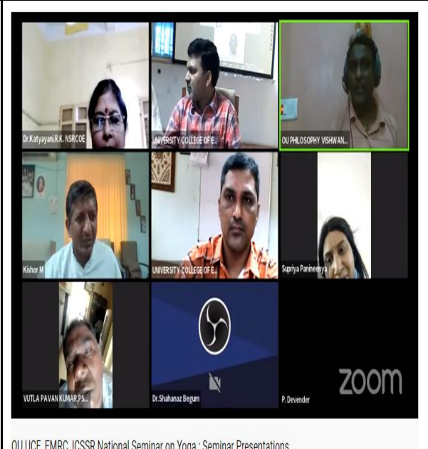
OU UCE, EMRC, ICSSR National Seminar on Yoga : Seminar Presentations