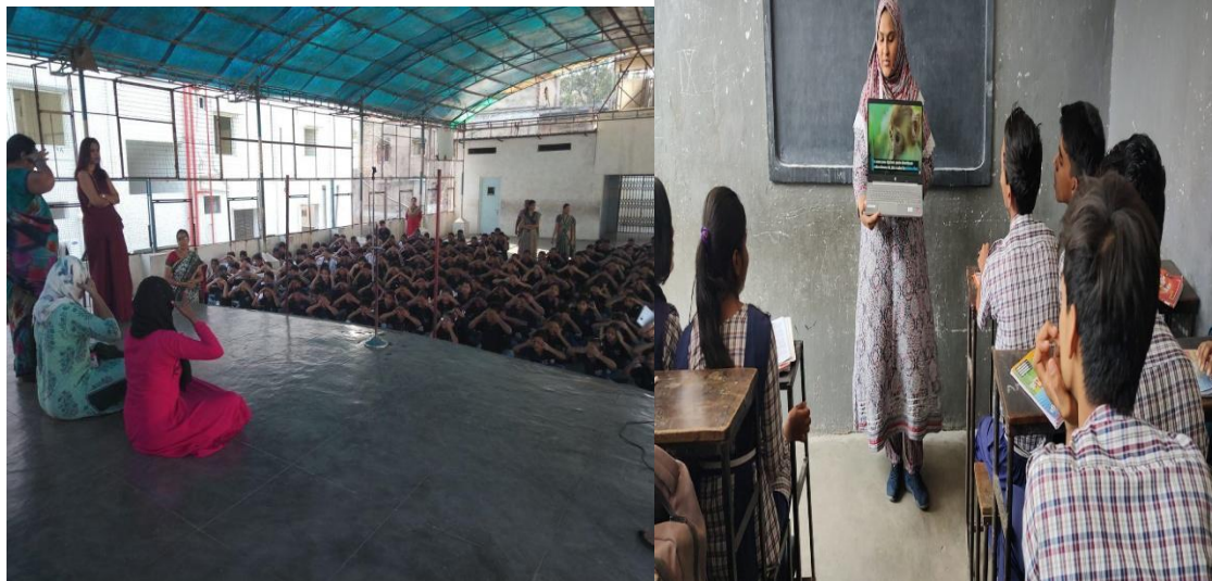
COLLEGE STUDENTS AT NIRMALA HIGH SCHOOL, KHAIRTABAD, TEACHING YOGA AND LESSONS IN DIFFERENT SUBJECTS

B.Ed students of the college are sent to different schools of twin cities to take up practice teaching.