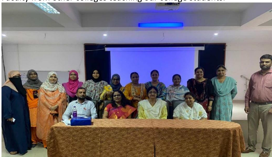
Our college faculty with teachers of Sultan Ul Uloom Public School, Banjara Hills.