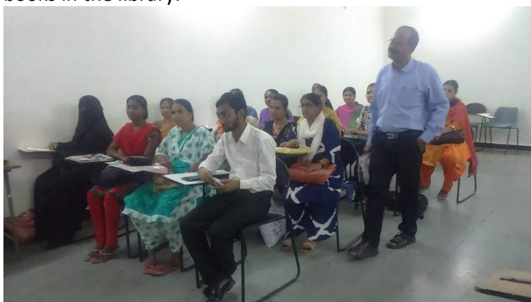
Faculty from other colleges teaching our college students.

Staff members from our college went to other colleges of education to refer to books in their libraries. Similarly staff members from other colleges came to our college to refer to books in the library.